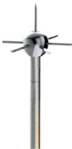
SEL series lightning rod